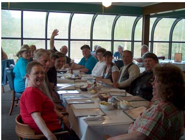
The Gang on our Caddo Lake trip last month. A marriage was restored & minds were renewed. Come with us next year. Your cell phone wont work!