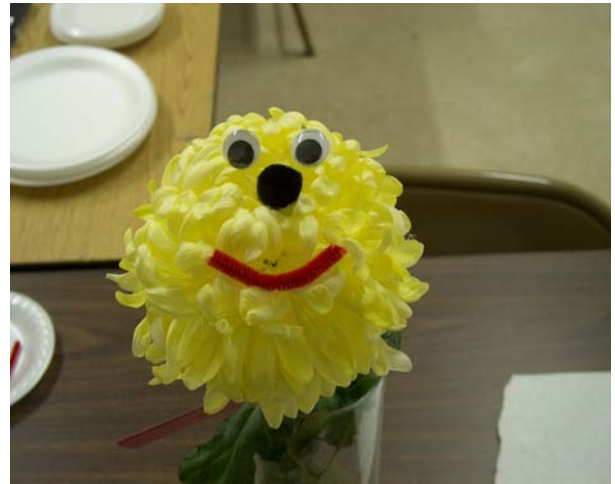
HAPPY MUM'S DAY