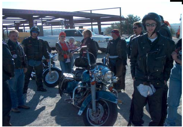
A group ready for a ride and a day of outreach.